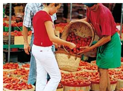
Jean Talon Market