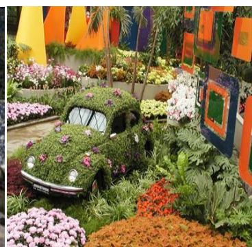
Botanical Gardens (Jardin Botanique) in Montreal